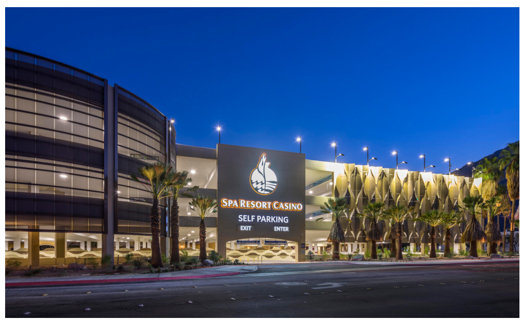
Calle Encillia Parking Structure, Palm Springs, CA