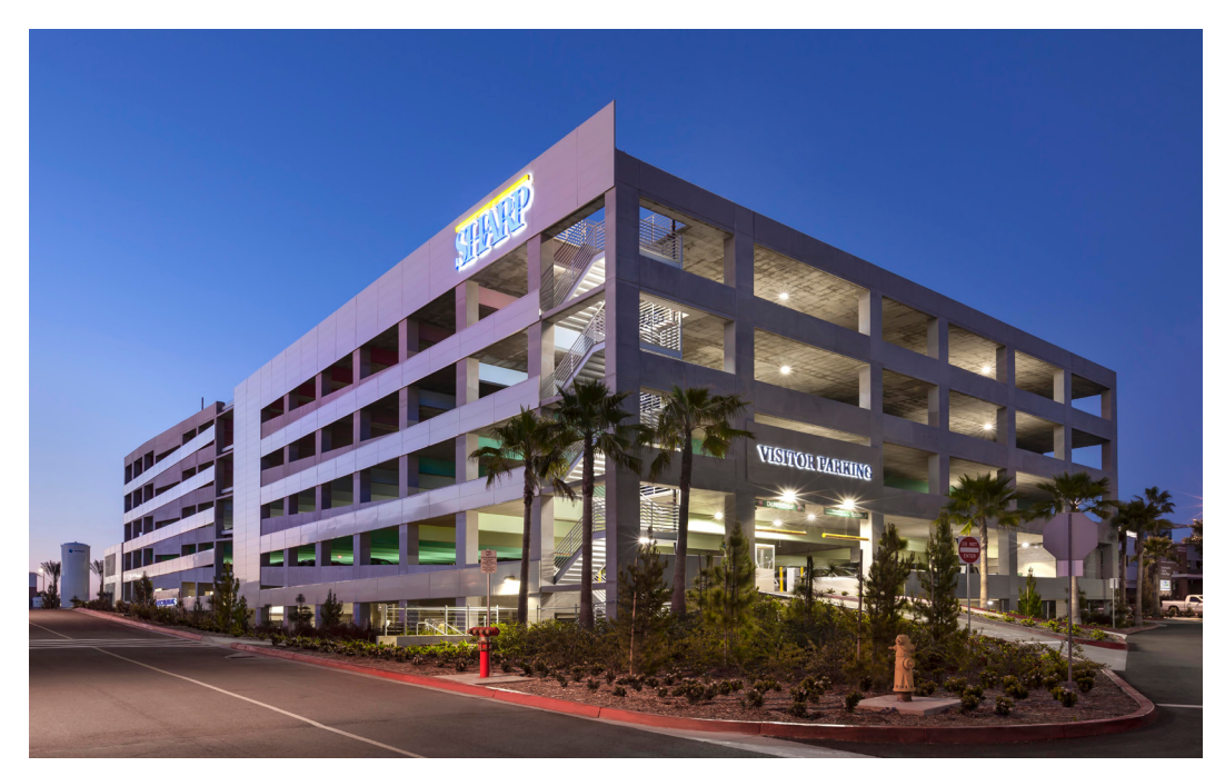
Sharp Medical Center Parking Structure Chula Vista, California